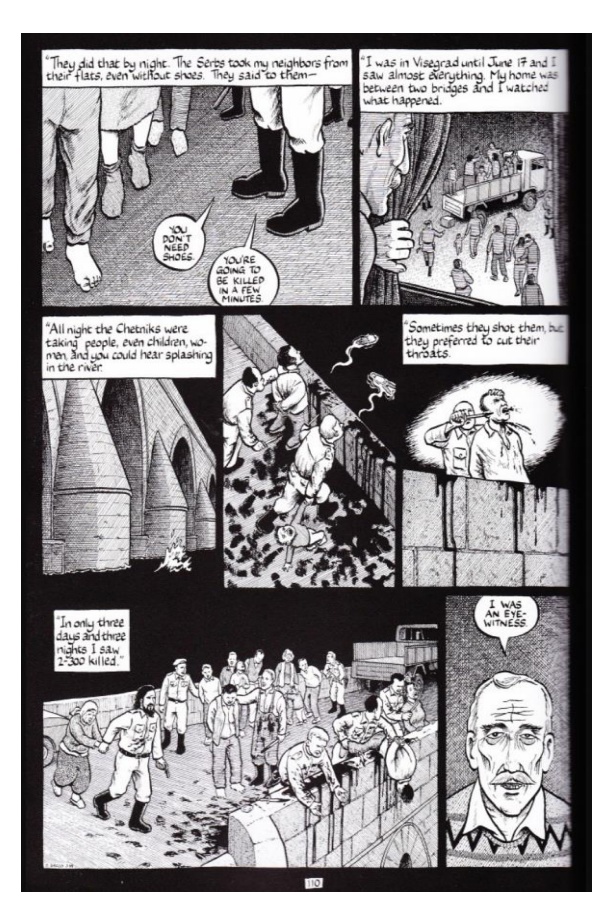
Pictured: Panels from Safe Area Gorazde (2000) where Sacco depicts an eye-witness account of mass murder in Visegrad.

Seminal work of graphic reportage depicting Sacco's experiences over four months in Bosnia (1994-5) where he combines oral testimonies of interviewees with his own reflections on experiencing this volatile environment. Safe Area Gorazde builds upon Sacco's legacy of comics journalism, begun in earlier works like Palestine (1997).