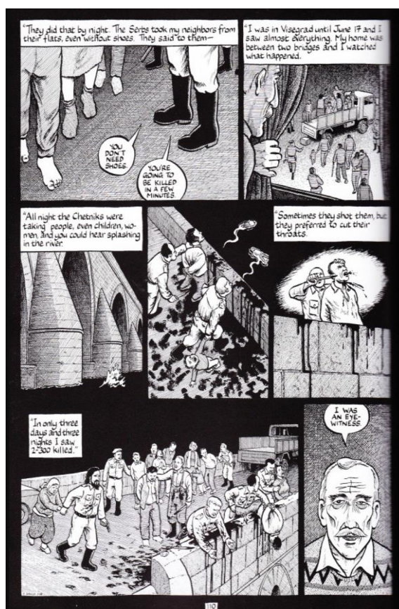
Pictured: Panels from Safe Area Gorazde (2000) where Sacco depicts an eye-witness account of mass murder in Visegrad.

Sands, a human rights lawyer involved in Pinochet's extradition trial, here combines a family memoir of his maternal grandparents with an account of how the term 'genocide' was