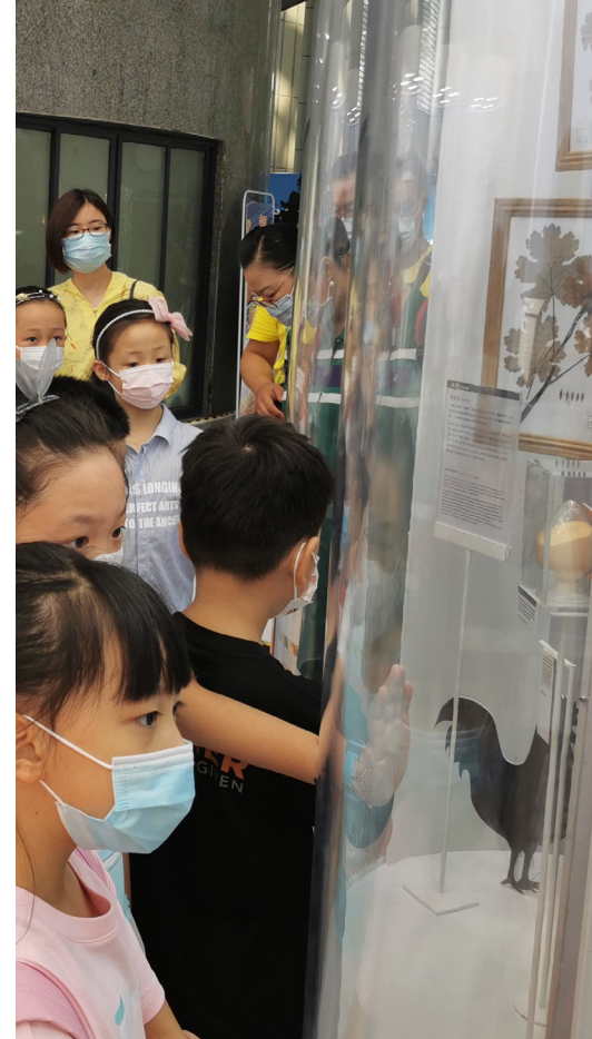
A school visit to Superbugs at the Zhejiang Science Center in Hangzhou, China, 2020.

Through international partnerships, the Science Museum Group extends its mission to inspire futures beyond our walls and develops capacity in our sector. This case study illustrates these drivers and demonstrates our commitment to equity and sustainability. Superbugs: The Fight For Our Lives is an exhibition about antibiotic resistance, an existential threat to humankind. It explains the issues, demonstrates the impact of individual behaviours, and illustrates the global scientific effort to combat the problem. After showing at the Science Museum in 2017/18, it toured via a “Blueprint pack”—only intellectual property travels, no artefacts or structures, and the exhibition is adapted by each venue for the local context. It is both cheaper to hire and more sustainable than a conventional exhibition. Superbugs primarily speaks to SDG 3, Good Health, but it also supports education, careers, innovation, and partnership (SDGs 4, 8, 9, and 17). Beyond London, over 1.5 million people engaged with the project in China, India, Argentina, Russia, South Korea, Mexico, and the USA. As well as visitors’ enjoyment and learning, the partners widened and deepened understanding about exhibition-making, audience engagement and innovative collaboration. Superbugs in India and China was supported by Wellcome and the British Council.