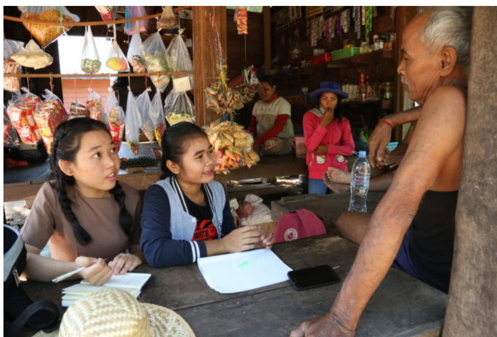
Students interviewing local residents in Anlong Veng.