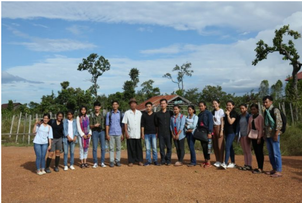
Students of the Anlong Veng Peace Tour and Members of DC-Cam at Anlong Veng Peace Center

The Cambodia team will hold their dissemination event, “The importance of intergenerational memory in Cambodia” (provisional title), towards the end of 2018, where they will promote their activities and findings with the wider Cambodian and conflict and reconciliation community.