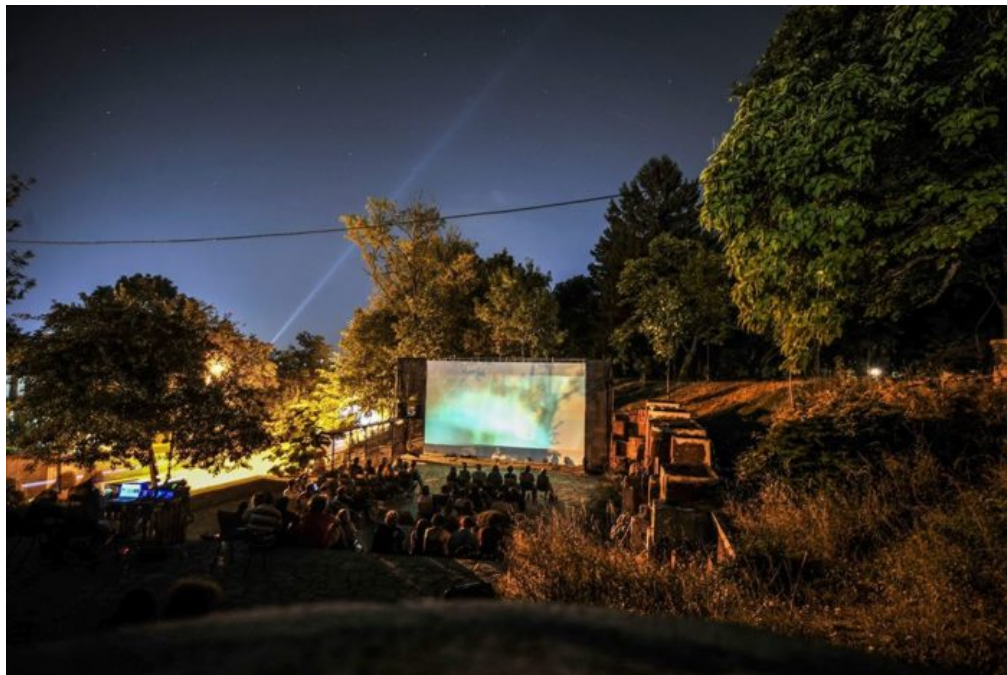
Kino Kubat screening as part of Peja-based Anibar Animation Festival, Kosovo

The proof of concept project encompasses of an ethnographic, arts-based participatory action-research approach in a pilot multi-ethnic municipal case study; delivering comparative focus groups in five municipalities.