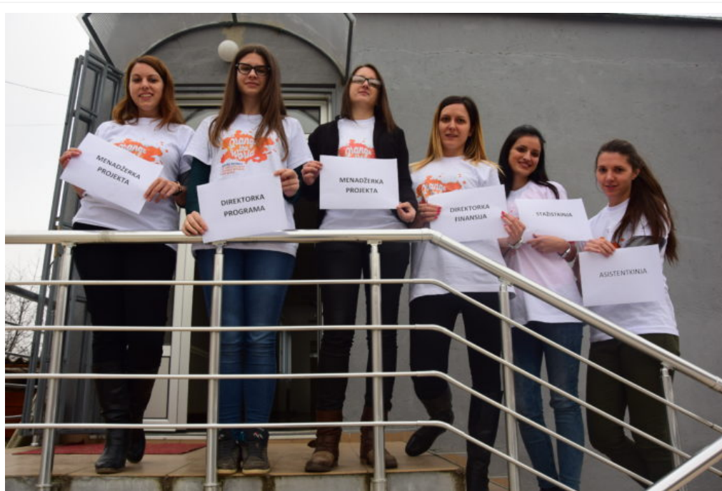
Team members of Mitrovica North based organisation NGO Aktiv.