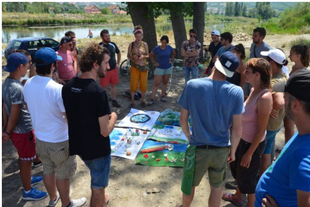
Young people take part in a workshop by Mitrovica-based arts organisation 7arte.

“ACT – Arts, critical thinking & active citizenship” is the name of the Phase 1 Kosovo project for Changing the Story. Find out more about what we’re doing in Kosovo, our approaches, processes and aspirations.