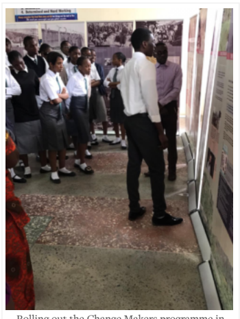
Rolling out the Change Makers programme in Nigeria

But is it research? What are the research questions—and what new insights can we gain?