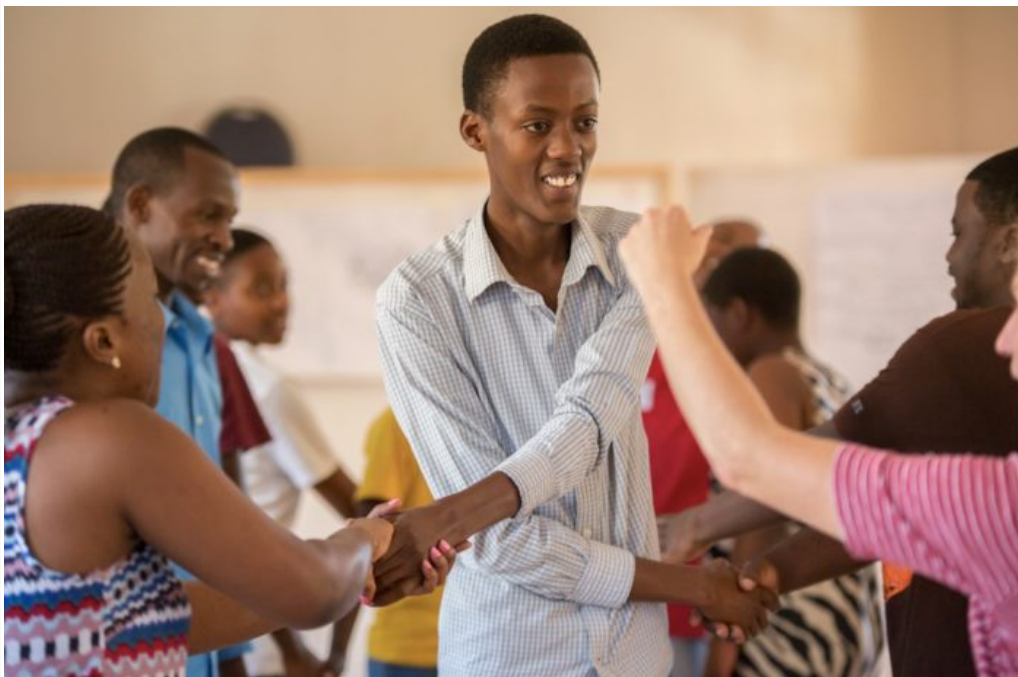
MAP Participants play Dr. Tangles, which is a good visual representation of a way a network plus project works. April, 2019.

Understanding the Project Structure: Co-Investigators and researchers attend the Network Plus meeting in Cambodia.