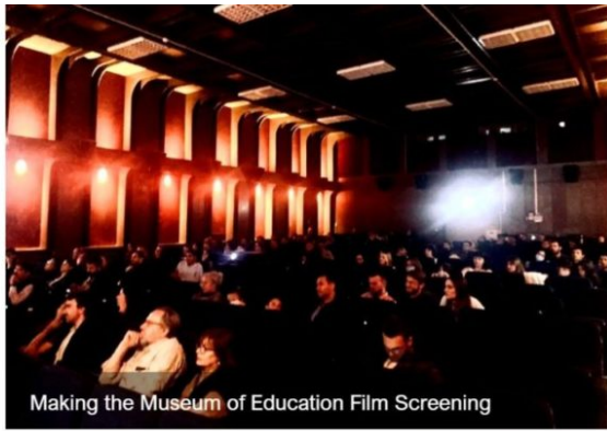
Making the Museum of Education Film Screening